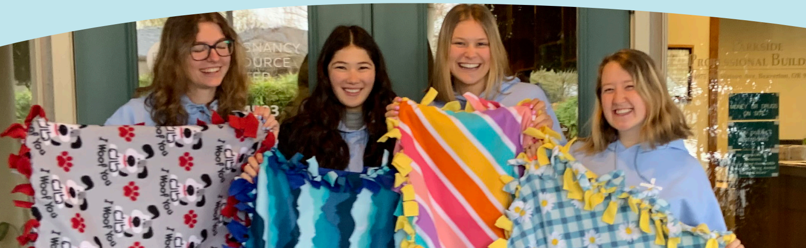
bottom: volunteers and their gift of quilts